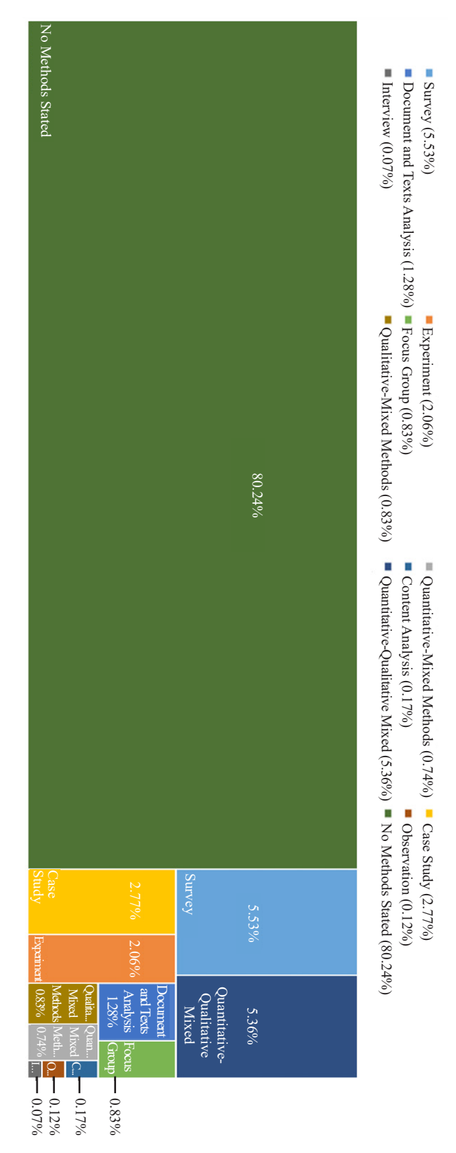
Figure 2. A treemap for visualizing research methods adopted in China's e-commerce research

Volume 3 Issue 2|2022| 191 Global Economics Science