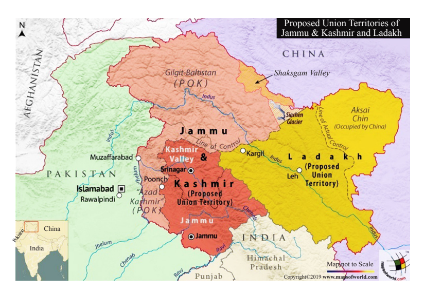
Figure 1. Map of UT of Jammu & Kashmir, India

Further, the inductive approach has been used. In the case of the inductive approach (Lathlean, 2006), no predetermined structure or framework is imposed on the data. Rather the findings or results are made to emerge from the data. Though the identification of major highlights is time-consuming, it is the most suitable and most commonly used approach. Many scholars impute the bias in subjective studies to a predecided framework, within which the respondents are made to fit their responses.